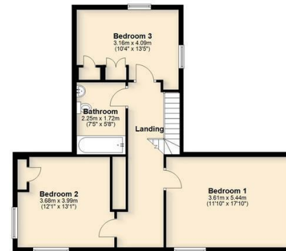
Total area: approx. 200.8 sq. metres (2161.1 sq. feet)